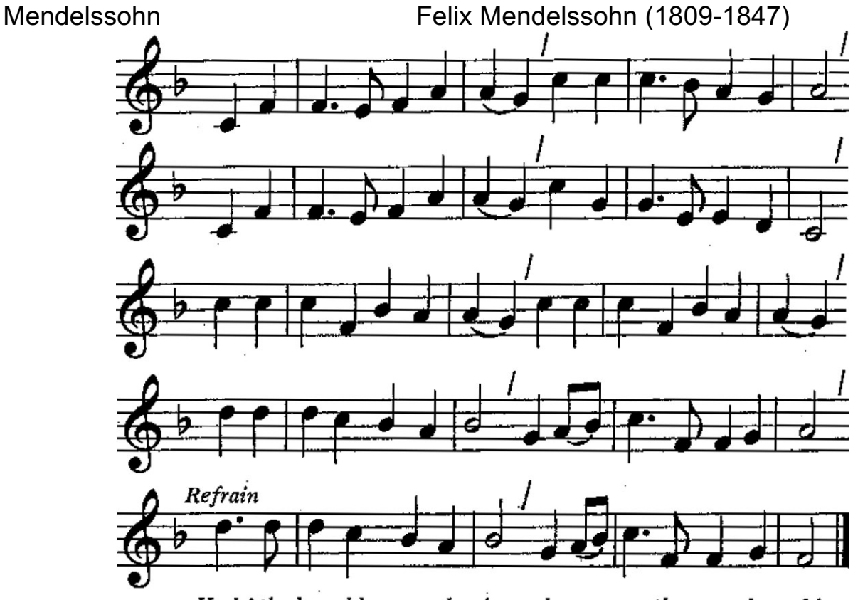
Hark! the he-rald an-gels sing glo-ry to the new-born king.